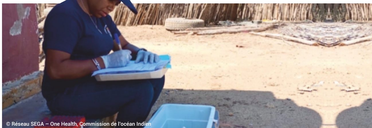
© Réseau SEGA – One Health, Commission de l'océan Indien