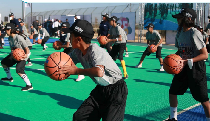
The Basketball Experience program reached more than 67,000 young people in 120 schools in Morocco and Nigeria.

This testimonial was extracted from a study on the impacts of microfinance on women, based on interviews with 460 women clients from 3 of Proparco's partner microfinance institutions.