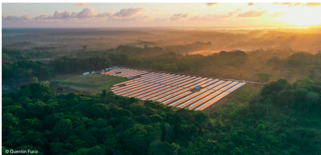
Sinnamary solar power plant, French Guyana